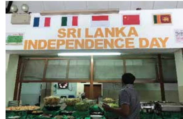
Adaaran Club Rannalhi