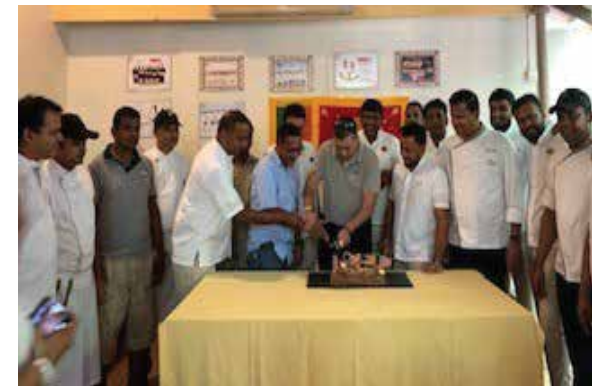
Adaaran Prestige Vadoo